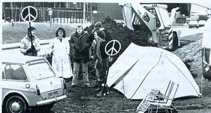
'Occupy the Site' - 25th January 1982, Peace Camp, Day 2

I still maintain that the success of the campaign was picking the 'target' - not just the site but the seat of decisions at County Hall, the Welsh Office and Home